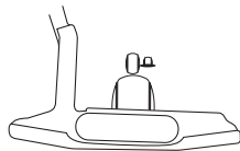
Square face impact