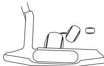
Open face impact