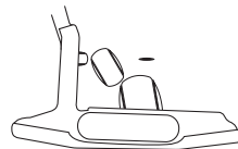
Close face impact